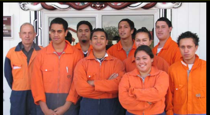
Tainui Taster Course Huntly students—class photo

ESITO's Pre-Employment Scholarships open on 1 August for study in 2011. $60,000 is available for electricity supply industry related courses. In 2010 ESITO allocated 16 scholarships across New Zealand.