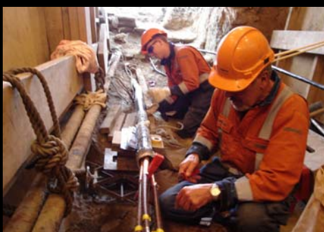
Cable jointers at work.

Cable jointers work on high and low voltage electricity cables. The job involves installing, joining and soldering power cables and testing and measuring the performance of the cables and insulation.